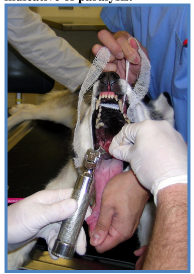
Airway exam under light sedation

Many experience Veterinarians will be highly suspicious of laryngeal paralysis the minute they hear the dog breathing but inspection of the larynx in a lightly-anesthetized dog is the only means of reaching a firm diagnosis. In the normal dog the larynx opens during inspiration and closes on expiration. Failure of the larynx to open during the inspiratory phase is indicative of paralysis.